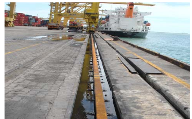
Crane rail after completed installation