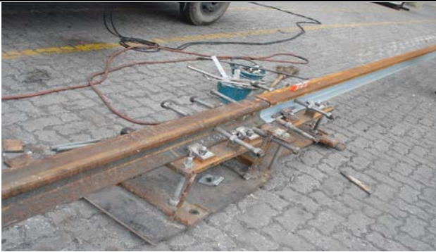
Rail equipped on rail jig as for welding preparation and alignment before welding