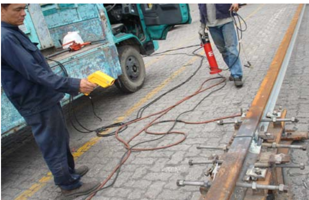
Temperature measured before preheat Measured rail temperature after heating, 450C is requirement (open space)