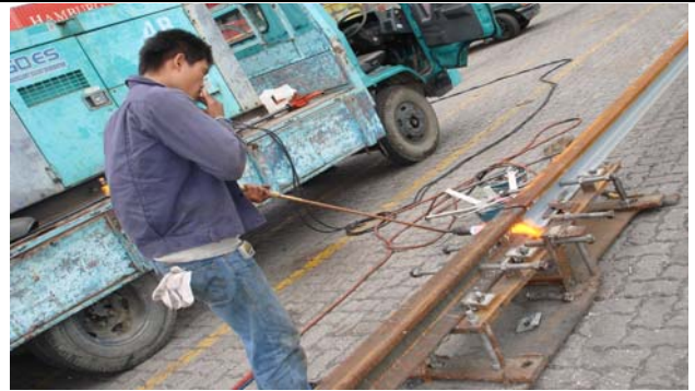
Preheat before welding