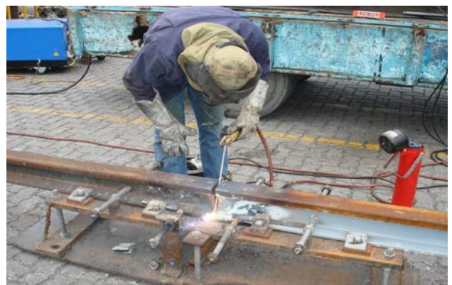
Welding process :welding rod LB116 LH .welding machine 500 A DC