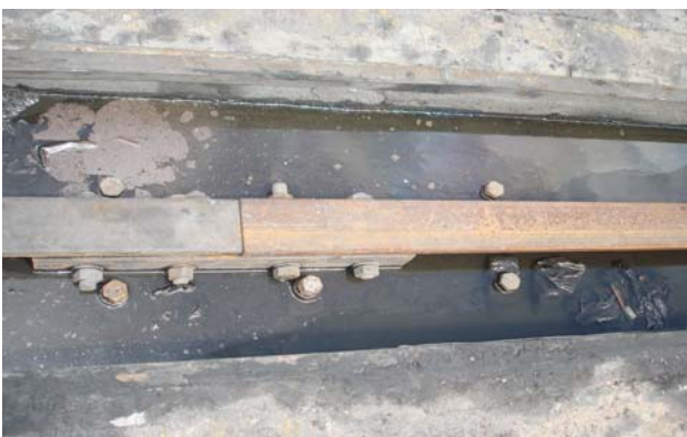
Rail connector at B2 & B3, this job carried out overreach to B2 around 5 meter due to connection joint stay inside B2 parameter